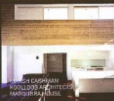
WITCH CASHMAN ROOLDS ARCHITECTS MARRISHA HOUSE