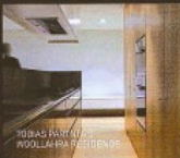
TODD PARTER WOOLAHRA RESIDENCE