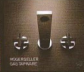
ROGER BULLER GAS TAPWARE