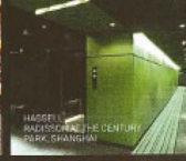
HAGGEL RADISSON BLUE CENTURY PARK, SHANGHAI