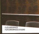
FUTURESPACE FUTURESPACE STUDIO