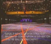
MIRABEL SERVICE DESIGN STRATEGY DESIGN OF CONVENTION & EXHIBITION CENTRE BALLROOM CARPET