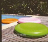
CLAUDE FENGER MELBOURNE