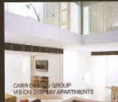
CARR GROUP VISION DISPLAY APARTMENTS