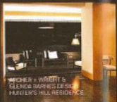
WICKER + WICKETT & GLENN BARRIS DESIGN HUNTERS HILL RESIDENCE