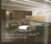
PROJECT CONTROL GROUP SPARKE HELMGP