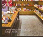
COXWAINER ARCHITECTS INN BEACON