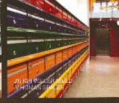
JULIEN WASSER VARDAR STREET