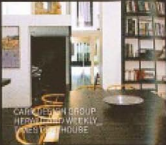
CARR GROUP HEDGECOCK WIRELY YES HOUSE