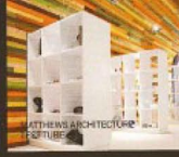
MATTHEWS ARCHITECTURE FORTITUDE