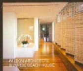
WILSON ARCHITECTS SUNRISE BEACH HOUSE