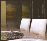
BLACKMAN MADONNA STREET ENTRANCE