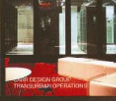
JOHN DESIGN GROUP TRANSURBAN OPERATIONS