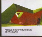
PEOPLE THORP ARCHITECTS GREEN ROOM