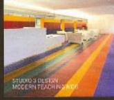
STUDIO 3 DESIGN MODERN TEACHING ROOM