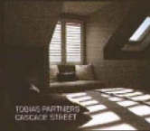
TODD PARTER CROCKE STREET