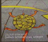
COLOUR PRINCIPLES DARWIN INTERNATIONAL AIRPORT