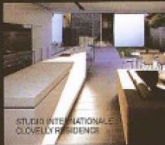
STUDIO 3 INTERNATIONALE CLOVELLY RESIDENCE