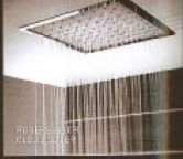
STINE STANGE REEL LITTE